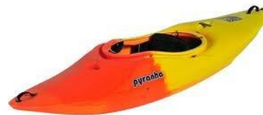
Class G-J - Slalom (e.g Fusion, G3 GTS)