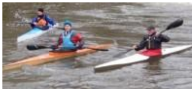
Class A - K1 Racing Single