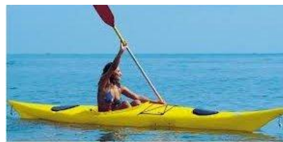
Class C - K1 Touring/Sea Kayak