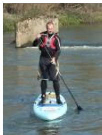
Class L - SUP (single or double)