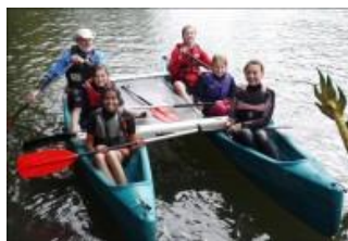
Class P – Katakonus (Treat as Adult Doubles Team when entering naming two primary paddlers)