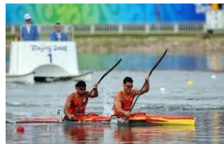
Class B - K2 Racing Double