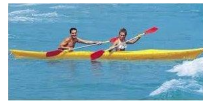
Class D - K2 Touring, etc. – Double