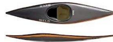
Class G-J – Slalom