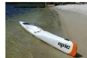
Class N - Surf Ski