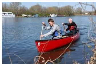
Class F - C2 Touring Canadian Double